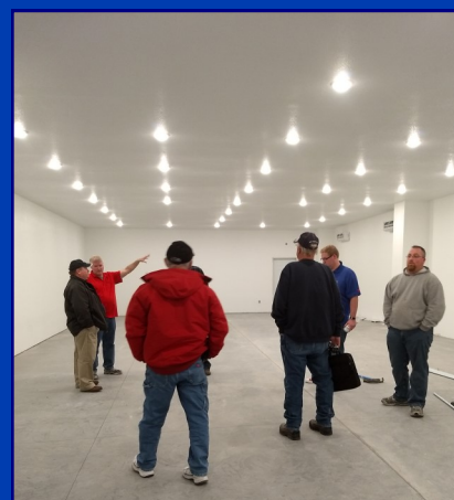
Old Threshers Board members look at the progress of the new doll and clothing museum located in Museum A.

Access Energy and Mt. Pleasant Utilities are in the process of making electrical upgrades in the campground along K and P rows.