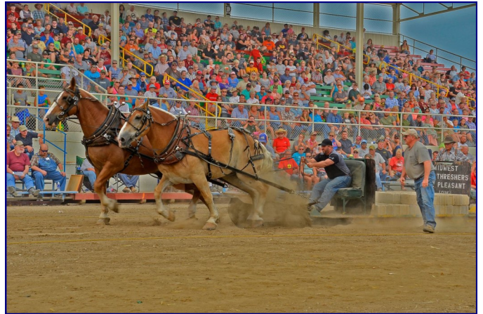
A team of horses pull a sled during the Don Carlson Memorial Labor Day Invitational Horse Pull. The event has been moved to Wednesday evening, prior to the start of the Reunion.

Admission to all country music shows are included with your gate admission. Reserved seats are available for $10.