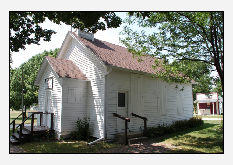
Other activities going on daily at the Pleasant Lawn School during the 2017 Reunion.

Help preserve this precious oral history before it's too late.