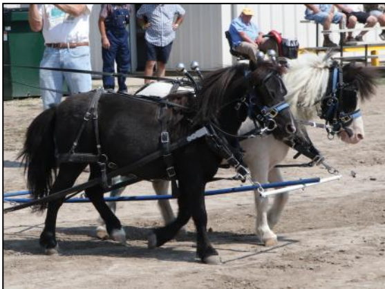
2024 Featured Horse "Miniature Horses"