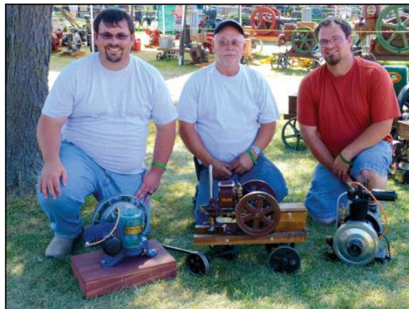
2024 Featured Antique Gas Engine Fractional Horsepower Gas Engines Owned by: Reynolds Family of Mt. Pleasant, IA