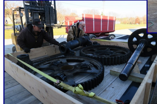
Steam Area volunteers work to take the gears off of the 32hp Reeves and ready them for transport to South Dakota.