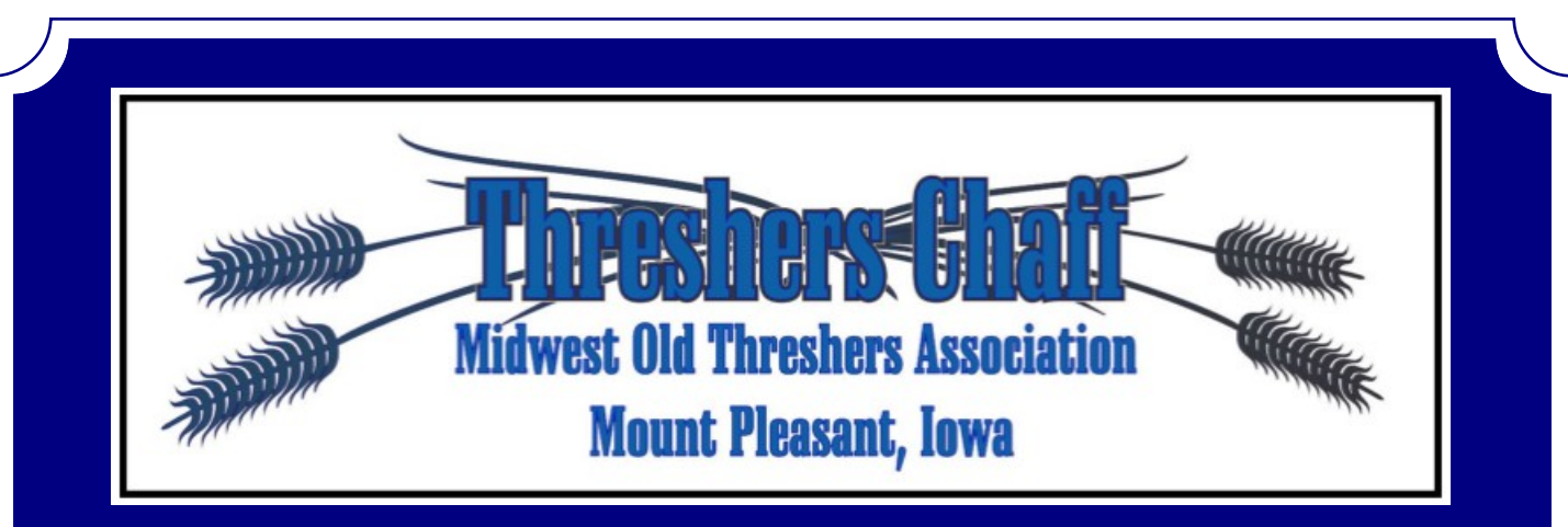
Volume 44, Volume 3