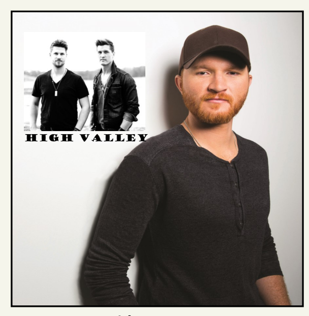
Friday, Sept 2