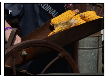
Look for the answers on page 5.