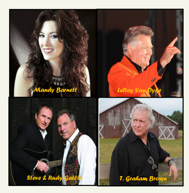
Thursday, Sept 1